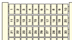
Vertical marking Increasing marker