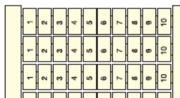
Vertical marking Increasing order repeated 10 times